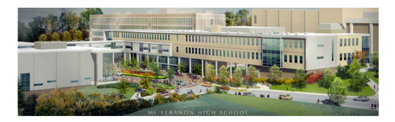
April 16, 2023